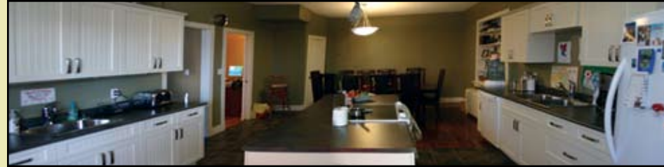
The kitchen in "Crystal's Home."

Social Services and the National Homelessness Initiative. Three built-in suites allow us to host up to 6 homeless girls who become part of the family and receive the love God has for them as the host parents care for them body, soul and spirit.