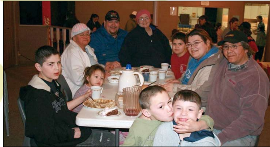
"Hands of Mercy" soup kitchen.

Many churches errantly leave the "good works" of the kingdom up to missions programs or parachurch organizations; these things are the work of every believer as well as