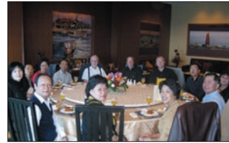
Mt. of Olives Bible School Alumni gathering.

Everywhere we went, people expressed thanks to the ACOP of Canada for sending missionaries to India so that they could hear the Gospel. We want to honour the founding missionaries that were sent from Canada more than 60 years ago, taking the message of the Gospel to this nation. These missionaries served at great personal sacrifice to see the church established in India.