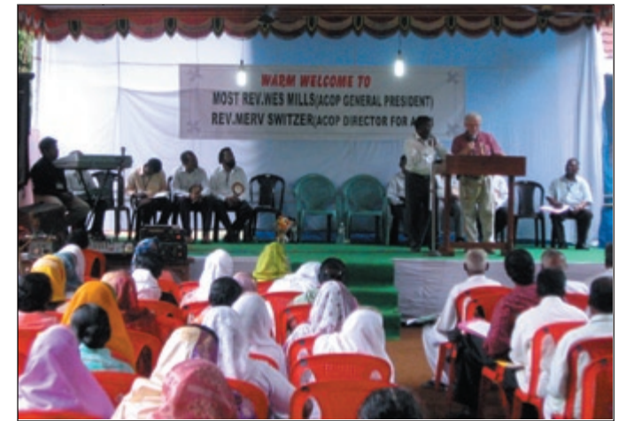
ACOP of India Pastors' Conference.