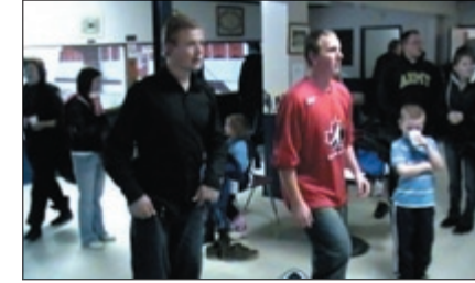
"Dancing Stars" and clowns were all part of the fun.