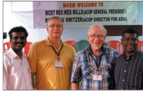
ACOP of India Pastors' Conference.

Everywhere we went, people expressed thanks to the ACOP of Canada for sending missionaries to India so that they could hear the Gospel. We want to honour the founding missionaries that were sent from Canada more than 60 years ago, taking the message of the Gospel to this nation. These missionaries served at great personal sacrifice to see the church established in India.