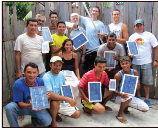
Building Solar Panels