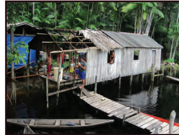
Delivering water filters to houses along the river

One thing is for sure - the mission was not built by just a handful of missionaries. Over the years God has sent numerous individuals, church teams and groups to help. The one thing that they have in common is that they have all come together as partners of the Kingdom work that God is doing here in Brazil. One work that has been carried for several years by our "partners" is our bio-sand water filter project. While the Amazon basin is abundant with water, most of it is not potable. Through our Agua Limpa (Clean Water) project, thousands of families have been given the gift of clean water. Through our contact many people have come to know Jesus as their Lord, and many people have been discipled. This past year we went through some hard moments. Just before Christmas last year our office was robbed and the thieves made off with a significant amount of money that put our project in a difficult place. At the eleventh