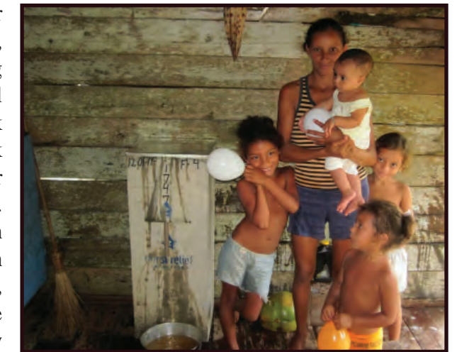
Helping save lives

hour when it seemed we would need to close things down, the Lord provided. God provided through our partners - faithful individuals from the U.S. and Canada, young adults groups, church congregations and our friends at Thirst Relief International. www.thirstrelief.org Giving clean water may seem insignificant but I can testify that through this partnership many people have been touched, prayed for, ministered to and saved. We still need partners for this project. Donations can be made through the Xingu mission website or through ThirstRelief's website. Just specify Brazil. Thank you for being a partner and please know that you are making a difference.