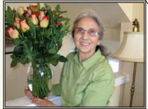
Do you think my Mom looks 80??

We are all doing well and are thankful to you as partners in this ministry. Our goal is, and has always been, to help advance the Kingdom of God in every way possible. Our prayer more than ever is for a move of God in our lives and