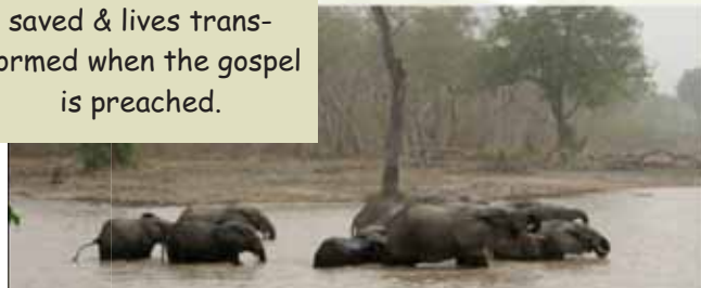
Bath time—play time!!

uting medical supplies, eye glasses or soccer balls, and always during our many one-on-one opportunities with Muslim friends ... Jesus was proclaimed.