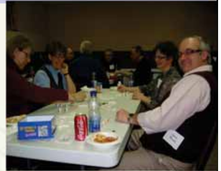
What's a leadership retreat without fun and games!!