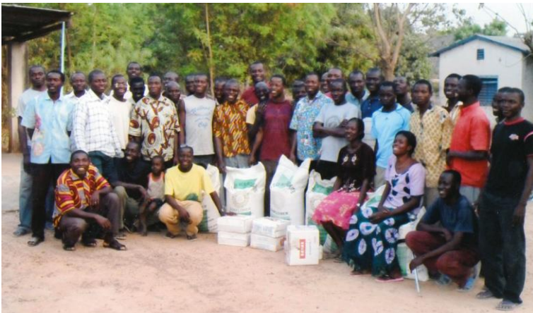
Students at Bible school in Leo, Burkina Faso, West Africa

During 2010 our ministry travels took us to El Salvador, Guatemala, Taiwan, Zambia, Malawi, Zimbabwe, Tanzania, Honduras and this January, 2011 to Burkina Faso, Africa. While in Burkina Faso I addressed the Pastor's Conference, spoke in several churches and then taught the 40 students in the Bible School in Leo. During the last session I took the opportunity to pray into each of the lives of the students, faculty and staff. Along with the “spiritual food” we left “physical food” and were able to provide the students and staff with over 700 lbs of rice, several boxes of pasta and 10 donkey-cart loads of firewood for cooking.